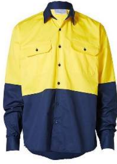
Hi-Vis Work Shirt